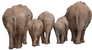
Parade of Elephants