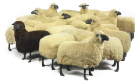
Herd of Sheep