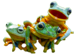
Army of Frogs