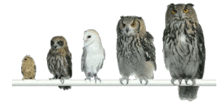
Parliament of Owls