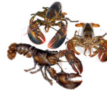
Risk of Lobsters