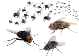
Business of Flies

From social butterflies to solitary scavengers, virtually all animals gather into groups at some point in their lives, the main reason being herd immunity , as groups of prey are harder to attack. Another reason, though, is the sharing of collective wisdom to make better decisions*. Anyway, whatever the reason that brings them together, something odd usually happens when individuals gather up: their groups go under bizarre, whimsical names . These group nouns are rarely used by scientists, but they provide an interesting insight into our relationships to other fellow animals. Some groups are even attached a different name depending on whether they're moving or not: for example, when a flock of geese is not in flight, it is called a ' gaggle '. Generally speaking, however, birds gather in flocks , fish in schools , insects in swarms and mammals in herds (herbivores) or packs (carnivores) .