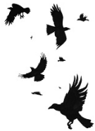
Murder of Crows