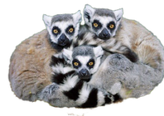
Conspiracy of Lemurs