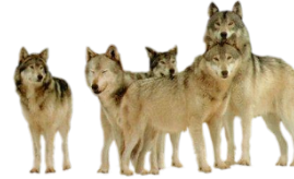
Pack of Wolves